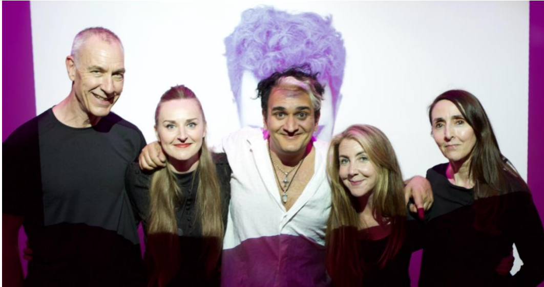
The Tim Arnold Company, June 2024

Our Super Connected live shows, screenings & workshops offer practical, creative and engaging explorations into the impact that digital media and devices are having on all of our lives.