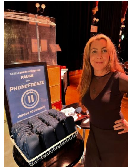
4. Phone Freeze pouches

"Where does our attention go? We journey through the complex relationships we have with our screens, our desire to be watched, to hide, and to be seen."