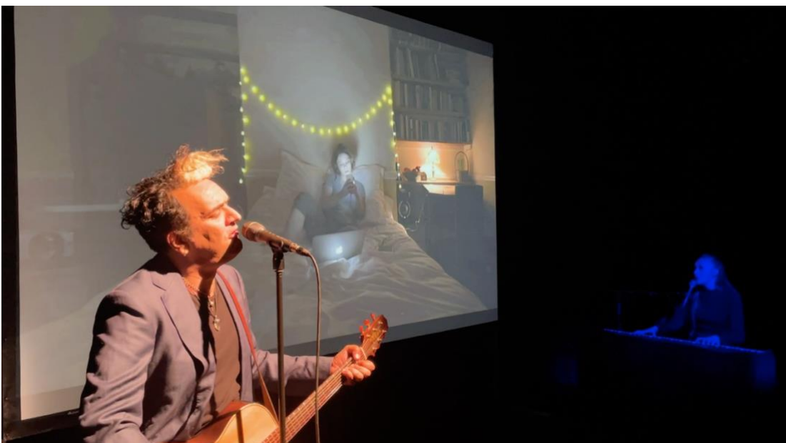
Super Connected LIVE, Brighton

24 th May 2004 The Guardian: Are Kids Losing Their Love of Music? (full article)